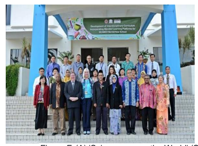
Figure F. Workshops on promoting blended learning activities in the borderless world using (1) Frog VLE platform (9 to 10 February 2015 at Malaysia Room) in collaboration with MOE Malaysia and FrogAsia; (2) Learning Activity Management System (LAMS) (11 February 2015 at R&D Division) in collaboration with LAMS Foundation Australia