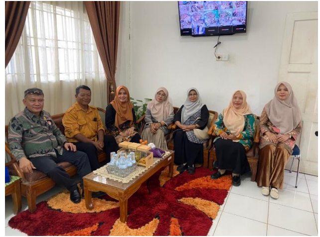
REFLECTION AND WRAP-UP SESSION