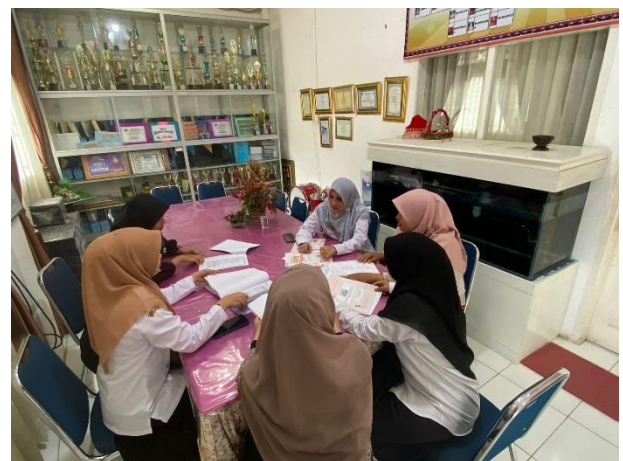
BRIEFING AND PLANNING DESIGNING LESSON PLAN FOR CBA PURPOSE