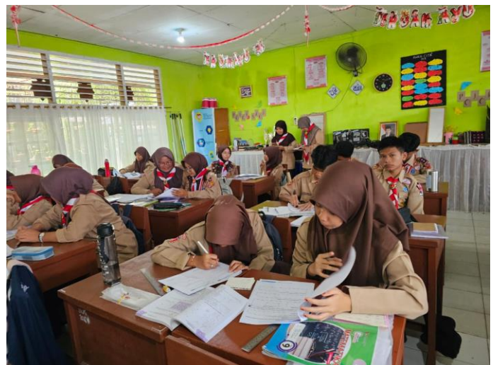
TRY OUT SMPN 24 PADANG