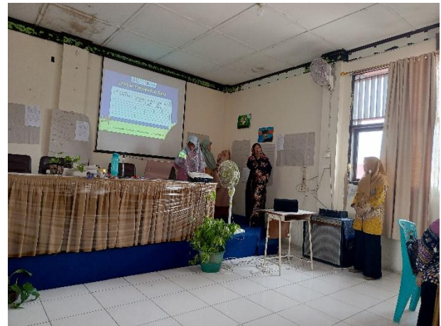
CLASSROOM BASED ASSESSMENT