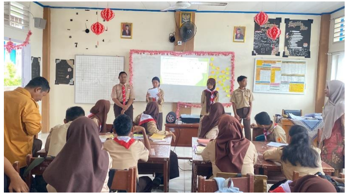
TRY OUT SMPN 4 PADANG