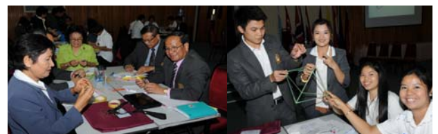
Delegates during an activity session