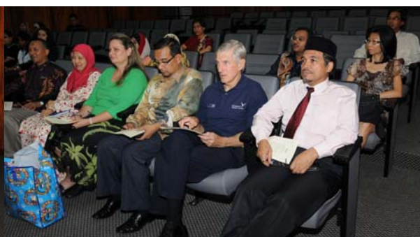
A session during the Closing Ceremony