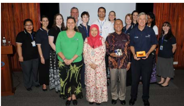
Smiles for the camera