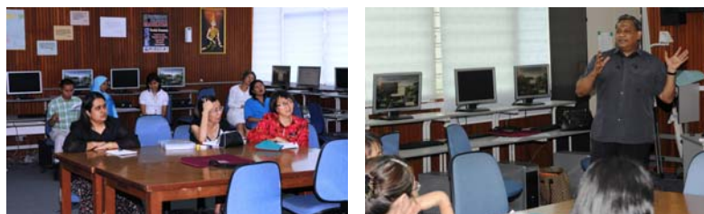
Sessions during the workshop