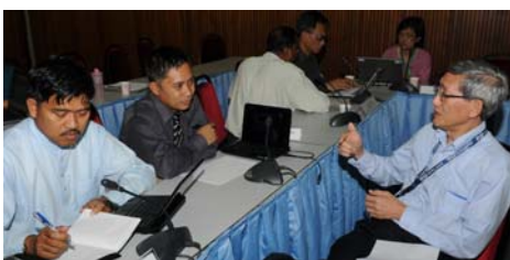
Discussion in progress