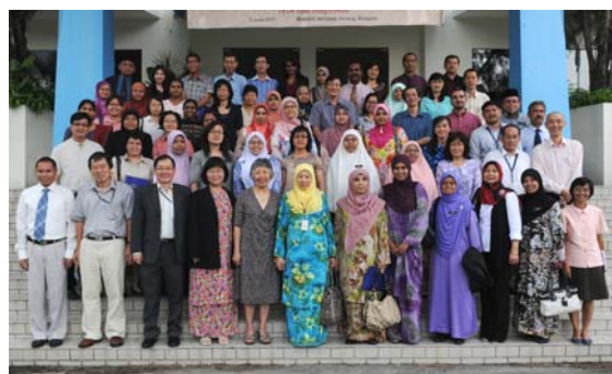
Smiles for the camera