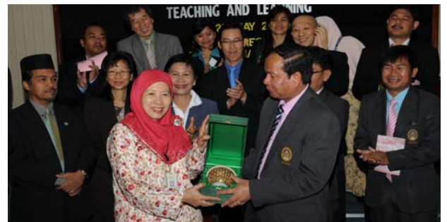
Smiles for the camera