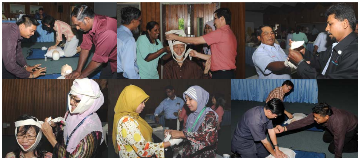
RECSAM staff learning first aid and life-saving techniques