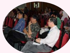
Participants paying full attention