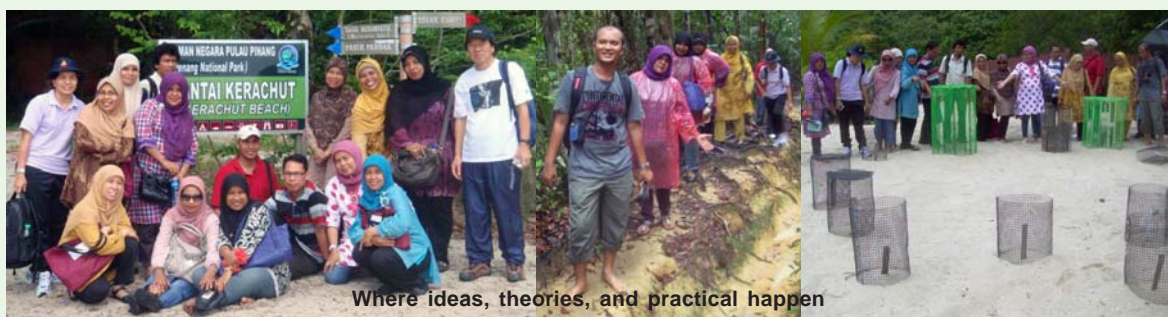
Where ideas, theories, and practical happen

HAVE you ever done jungle trekking bare-footed, or wearing slippers or office shoes in the rain? A group of 22 Indonesian (Aceh) science teachers who were attending a professional development course at RECSAM from 14 March - 6 May 2011 braved the rain and tested their endurance in seeking 'Ilmu' (knowledge) and experience by doing that from Teluk Bahang to Pantai Keracut in the Penang National park on 4 May 2011. This was truly the first time ever done by a group of RECSAM course participants. They challenged the perilous and slippery terrains in the tropical rainforest on a rainy day to study its flora, fauna and ecology. They explored the phenomenal meromictic lake at Pantai Keracut, figuring out how two layers of water do not mix, strangely, warm water at the bottom and cold water on top, against the normal principles of science. They wanted to visit the turtle hatchery but the main entrance was locked.