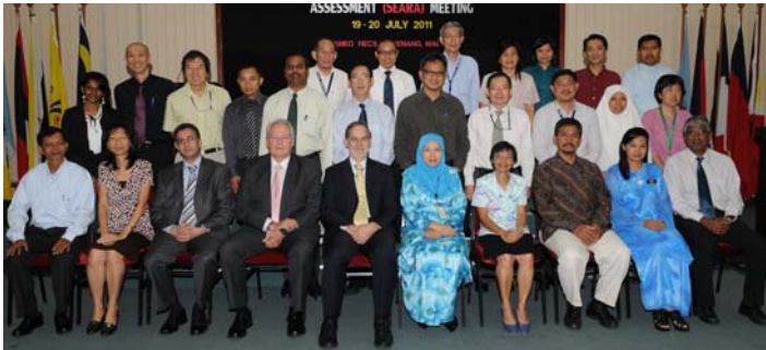
One for the album: A group photo taken during the Meeting