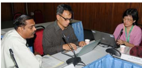
A session during the meeting