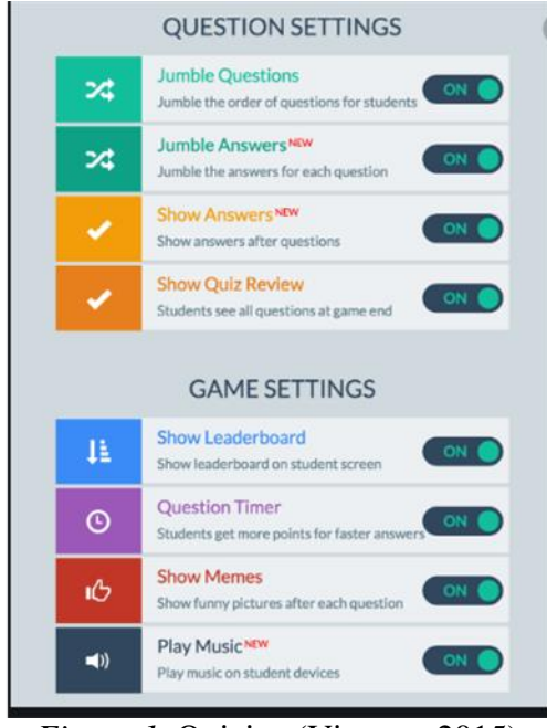
Figure 1. Quizizz (Vincent, 2015).

Audience Response System (ARS) Platforms. Online quizzes portals like Kahoot and Quizizz (Figure 1) or Quizlet (Figure 2) are examples of audience response system (ARS) platforms that allow teachers to set questions in the form of online quizzes that can be administered to test students during the lesson.