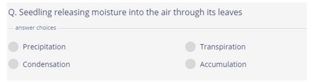
Figure 3. Sample quiz posted onto Quizlet with options to be chosen by students.

Students are given options either to answer the questions individually or in teams as illustrated in Figure 3. They gather points based on the speed and accuracy of the answer provided that will be showcased in the digital leader board (Mader & Bry, 2019).