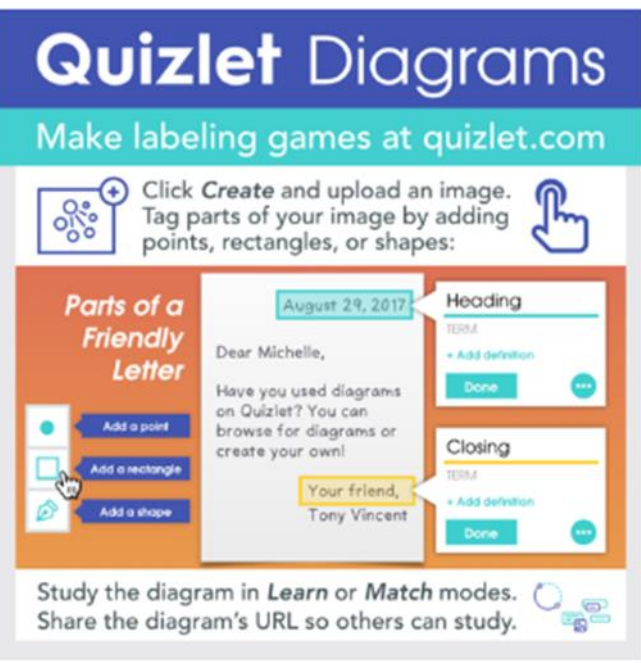
Figure 2. Quizlet (Vincent, 2015).