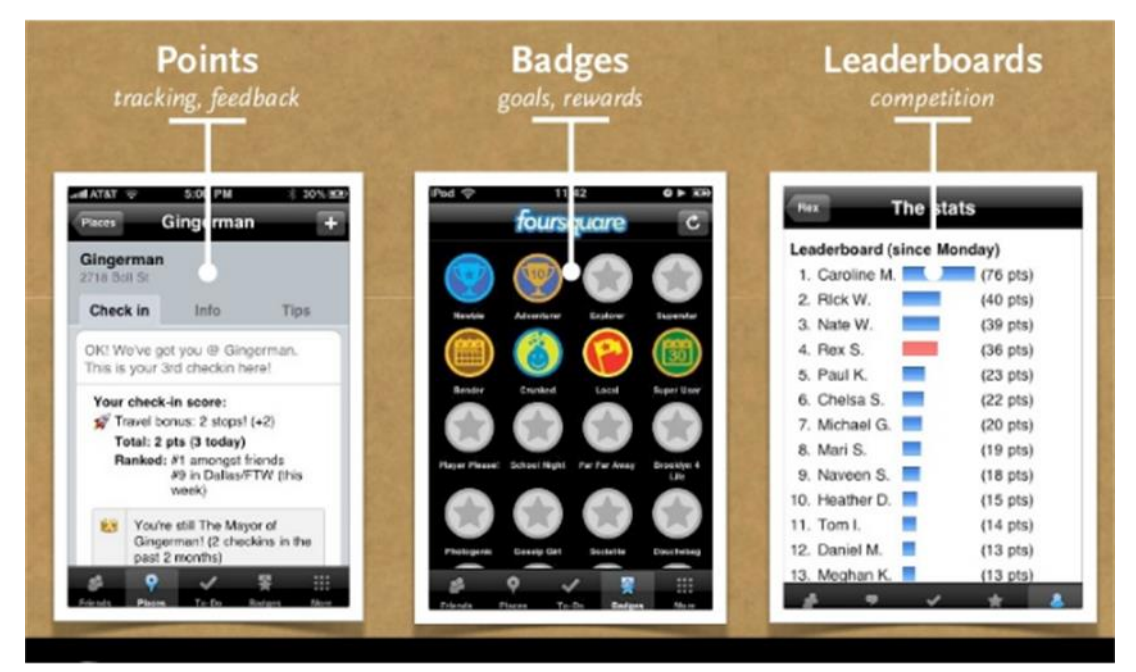
Figure 6. Sample gamification aspects with badges, leader boards and rewards.

Although the gamified web-based learning revealed interesting and positive results, it was however pointed out that a drawback was discovered. Some of the gamification aspects found to be instilling negative impacts on student learning include badges, leader boards, and rewards (Figure 6) (Fleischmann & Ariel, 2016).