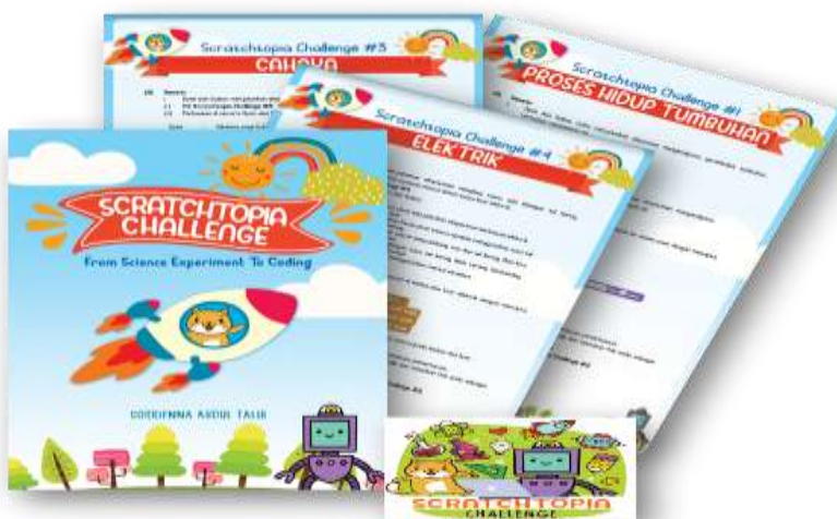
Figure 1 Module of Scratchtopia Challenge

Technology has been recognized as an integral component of the Primary Science Standard Curriculum (KSSR) as well as a new component called 'Elements Across the Curriculum' (EMK) that will help improve the quality of KSSR implementation (Kementerian Pendidikan Malaysia, 2016). A technology tool, for example, could be used to make science learning more interesting and effective in such a way that makes an abstract or difficult concept easier to learn. Yet little discussion has been made on how the technology could be integrated into a science experiment in the KSSR. Experiment or practical work is one of the science teaching methods used to discover specific concepts and principles. Ideally, students should have control over their learning by designing the experiment, drafting the experimental method, measuring the data, and analyzing it (Kementerian Pendidikan Malaysia, 2016). Teachers' control, however, largely limited these practices (Osborne, 2015). To achieve these idealistic practices, the researchers intend to design a technology tool to be integrated into the science experiment. By using Scratch programming, a prototype has been created titled "Scratchtopia Challenge: From Science experiment to coding" (see Figure 1 and 2). Overall, 15 science experiments were developed that cover the science experiment for Standard 4, 5 and 6.