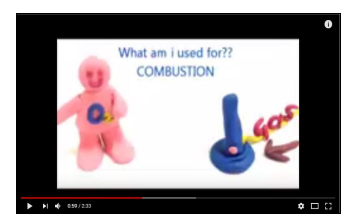
Figure 4. Oxygen (Sandaram et al., 2016).

By making and creating the learners' own video, publishing and sharing it with the public, this activity also helps members of the general public to feel closer to science as well as to make science easier to learn and apply. It is evident from a study that video making is a means of engaging students in the propagation and explanation of science. They enjoy themselves and become creative. It can increase open appreciation of chemistry as an important instrument or mechanism to satisfy the needs of a society, to develop young people's keen interest in studying science, and to breed passion for its creative future (Burke, Snyder, & Rager, 2009).