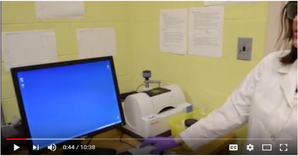
Figure 1. FTIR Analysis (FTIR Spectroscopy) (Labtesting, 2013).

Instructional Video . An instructional video shows step-by-step procedures or instructions of how to use or control or handle some equipment. As an example, Figure 1 illustrates a teacher is describing how to use an FT-IR or UV-Visible spectroscope or any related apparatus that needs extra precaution to handle in a university course called "spectroscopy". The instructions given in video form include steps or procedures to prepare samples, type of sample that is suitable to run on the precise apparatus and what result to expect.